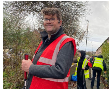
Leading a planting and tidying session in the Terraces

We need big changes at a city-wide level plus engaged residents and business locally. We can all play a part in improving our environment and your Labour-led Council will continue to work towards a sustainable future.