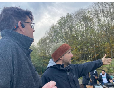
Visiting the brilliant ‘Wild Roots’ community garden in St Ann’s

Did you know? ....Carbon emissions across the City have fallen by 42% since 2005. The Labour-led council has unlocked national net-zero funding to decarbonise public-sector buildings and introduce low-cost, low carbon “heat zones” for residents and businesses. All new council vehicles will be low-emission (usually electric) and we’ve overseen the planting of 8,500 trees and 657 metres of hedgerow over the last 12 months.